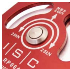
Bushings Ideal for high loads at low speed