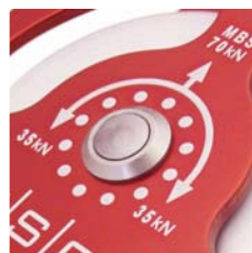
Roller Bearings Ideal for low loads at high speed