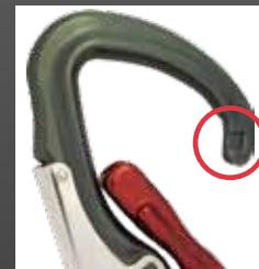
Blind nose to reduce rope snagging