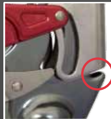
Safety Heel to further reduce the risk of accidental opening