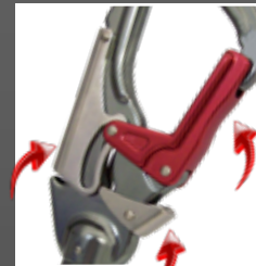
Available with Doubleaction or Triple-action mechanism