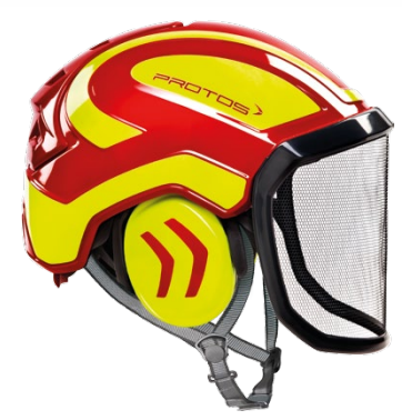
Protos Integral Arborist red/yellow