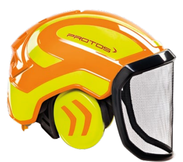
Protos Integral Forest orange/yellow