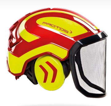
Protos Integral Forest red/yellow