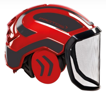
Protos Integral Forest red/grey