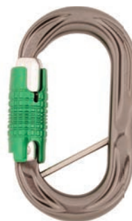
> Locksafe CB