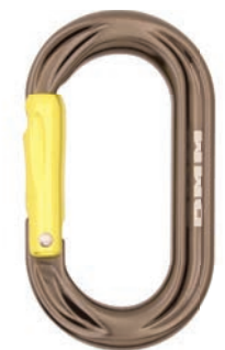
> Straight Gate