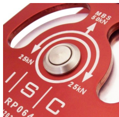
Bushings Ideal for high loads at low speed