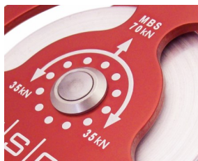
Roller Bearings Ideal for low loads at high speed

ISC Prussik Pulleys have tamper-proof Rivets, in compliance with CE EN12278 (2007) & NFPA (1983). These pulleys are available with Bushings, or Roller Bearings.