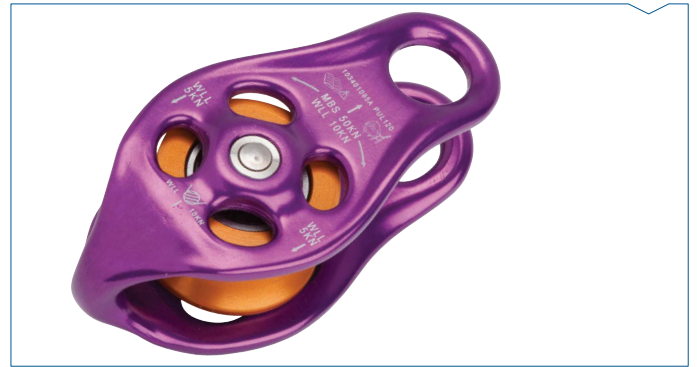
Pinto Rig (Large)