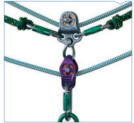
Install a Pinto and spacer on a rope loop to create an adjustable in line anchor when attached with a prusik