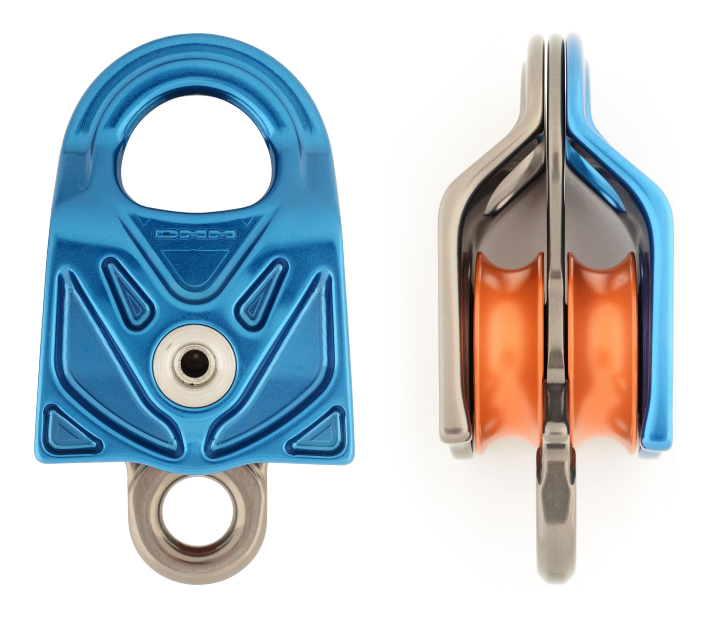
Gyro Twin Product code: TBC

Single attachment, dual sheave, prusik minding with becket.