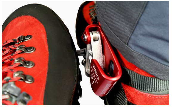
The foot-lever can be used to open/close the cam, with the other foot. The foot-lever can also be hooked over the body of the device (see photo to right), to hold the cam in the open (disengaged) position.

Should the user prefer, the foot-lever bar can be removed, by unscrewing an Allen screw. Removing the foot-bar allows greater pivot range of the cam. This in turn allows the user to deliberately remove the rope from the device, by using a kick technique with only the leg that the device is mounted on.